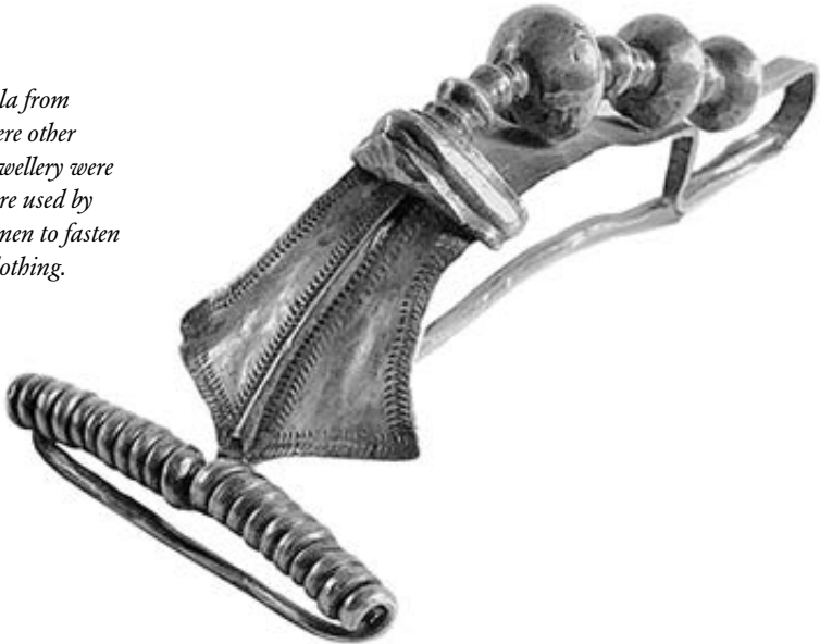
Dacian silver fibula from Transylvania, where other similar pieces of jewellery were found. Fibulae were used by both women and men to fasten various items of clothing.

I say almost all because small enclaves were left unchanged by the Indo-European migrations, and following these, came several other peoples speaking entirely different languages. Of the latter, the Finns, the Estonians, the Hungarians and the Turks are the foremost examples, while of the remaining pre-Indo-Europeans, only the Basques form a distinct ethnic and linguistic group to this day, in the north of Spain and south-west of France. Some anthropologists claim that Sicily too was mainly populated with pre-Indo-European peoples; the Sicilians, however, have adopted the language of their Roman rulers and no traces were left of any language that preceded Indo-European idioms.