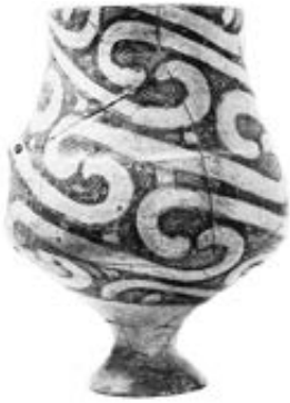
Pottery of the Cucuteni culture (4800 to 3000 BC)

If you look at a physical map of Romania, observe the shape of the Transylvanian Plateau: you could say that our country forms a great circle around Transylvania. Well, that was where the Romanian nation was born.