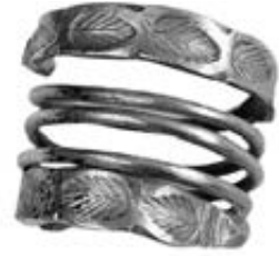
Dacian silver ring from the 1 st century AD, part of the hoard found at Măgura, Teleorman County

To the south there lived the Thracians. Many historians believe that the Geto-Dacians were in fact a Thracian tribe, relying on a single sentence from the Greek historian Herodotus (5 th century BC). Today it seems that this is not exactly true. They may have been close relatives of the Thracians, but their languages (or what little we can make of them) were not very similar, for in the Geto-Dacian language we do not find the same place names, nor the same royal names as in Thracian, and