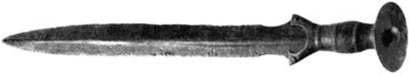
Sword discovered at Benești, Sibiu County, dating from the late Bronze Age. The marks on its edge reveal that it was used in battle.

I say almost all because small enclaves were left unchanged by the Indo-European migrations, and following these, came several other peoples speaking entirely different languages. Of the latter, the Finns, the Estonians, the Hungarians and the Turks are the foremost examples, while of the remaining pre-Indo-Europeans, only the Basques form a distinct ethnic and linguistic group to this day, in the north of Spain and south-west of France. Some anthropologists claim that Sicily too was mainly populated with pre-Indo-European peoples; the Sicilians, however, have adopted the language of their Roman rulers and no traces were left of any language that preceded Indo-European idioms.